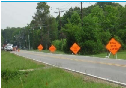
Signage notifies residents of underground construction activities.