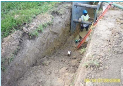
Trench boxes are used for pipeline installation.

The purpose of this project was to increase the capacity of the gravity sewers upstream PS 59 and PS 60. The project consists of approximately 18,300 feet of gravity sewer upstream of PS 59 and PS 60.