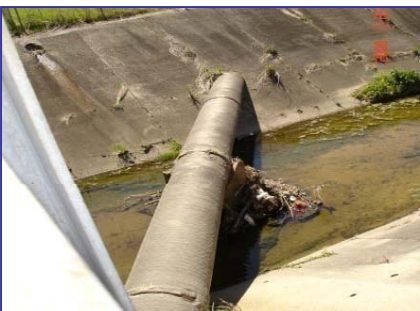
Over 18,000 linear feet of gravity e main will be upgraded .